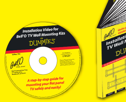
Step-by-Step DVD and Manual